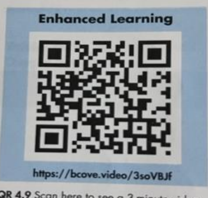
QR 4.9 Scan here to see a 3-minute video of the MR. SOPA steps.

QR 4.1 Scan here to see a 2-minute video about PPV terminology.